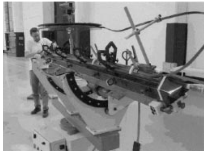
Fig. 2. Coil winding machine in operation.