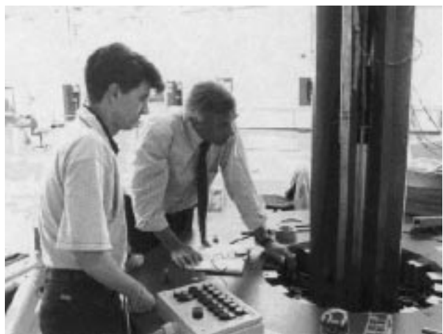
Fig. 3. New collaring press operating for first mock-up test in fabrication hall. A hole in the ground provides the vertical passage of the collared coils.

a brand new fabrication facility. ACCEL has already started setting up its procedures by making a number of test and operational trials. They can rely to a high extent on the experience